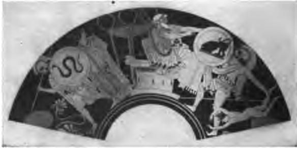
Fig. 92. Priam slain on the Altar.

daughter of Priam, Cas san'dra, was dragged from the sanctuary of Athena and carried into slavery; the same fate overtook Hector's wife